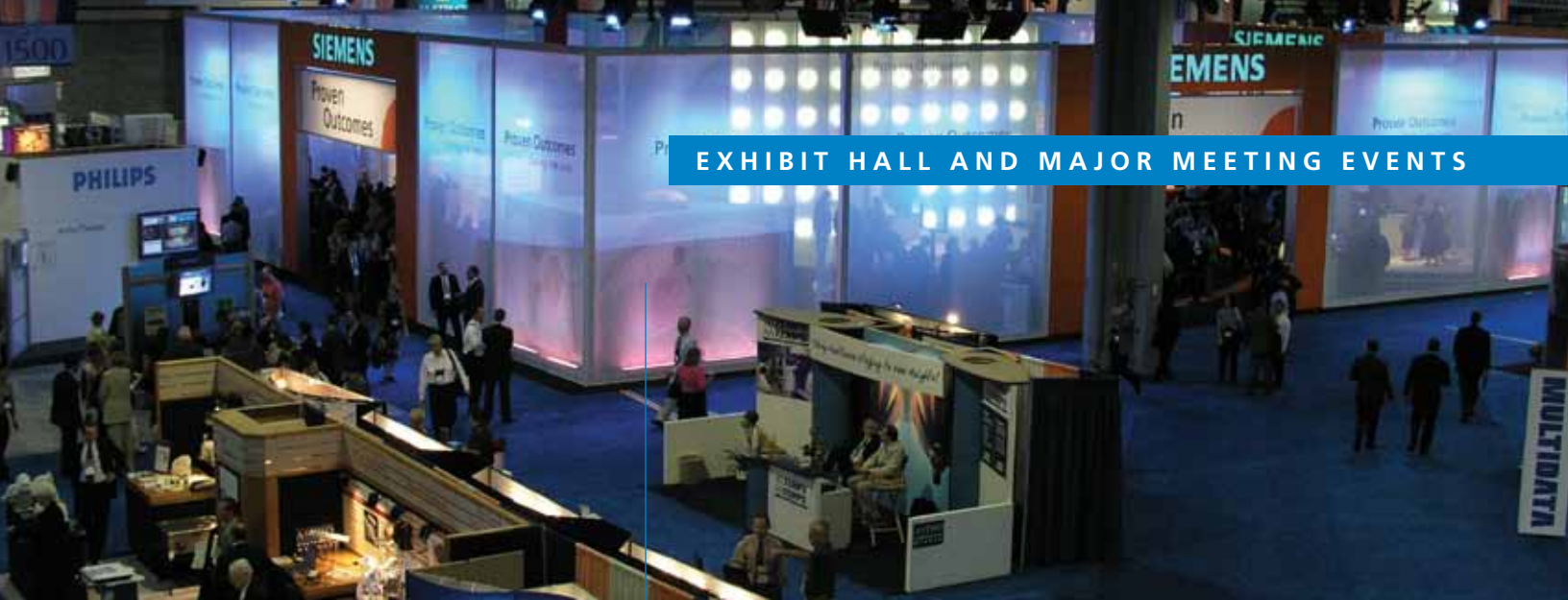
EXHIBIT HALL AND MAJOR MEETING EVENTS

Georgia World Congress Center Georgia Dome